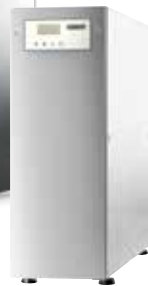
Reverse osmosis HYDROLINE PURE RO-S