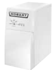
Water softener HYDROLINE PROTECT SE-H