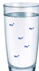
PARTLY DEMINERALISED WATER