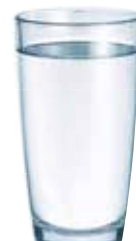
FULLY DEMINERALISED WATER/ OSMOSIS WATER