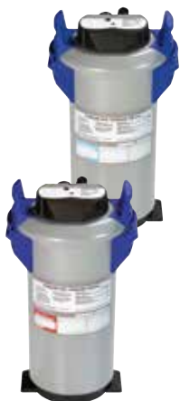
Partial demineralisation HYDROLINE STAR PD

The partial demineralisation process extracts the portion of minerals that is responsible for the carbonate hardness from the untreated water. As a result, it is a suitable system to use for rinsing glasses when the carbonate hardness of the untreated water makes up a very high proportion of the total hardness. It is suitable for any type of dishwashing - without restrictions.