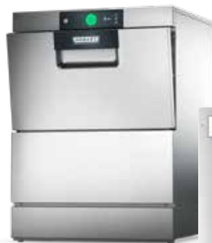
Reverse osmosis HYDROLINE PURE RO-I